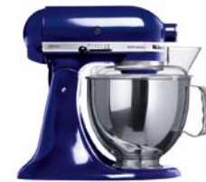
COBALT BLUE 5KSM150PSBU

The changing seasons announces the end of the summer and the beginning of autumn: the sky darkens, assuming a Cobalt Blue shade, and, as the leaves fall, they turn colour from green to Yellow Pepper and Boysenberry hues. Cooking now means moving back to the cosy indoor kitchen.