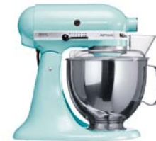
ICE BLUE 5KSM150PSIC