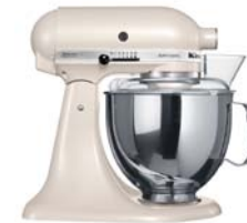
CAFÉ LATTE 5KSM150PSLT