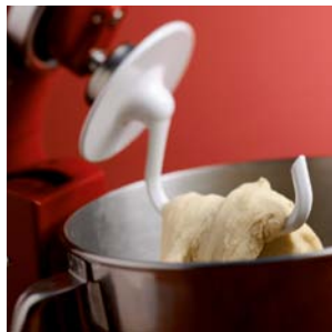
DOUGH HOOK K45DH

Used for incorporating air into eggs, egg whites, whipping cream and dips (such as mayonnaise). Made from hand polished aluminium with metal head. Not dishwasher-safe!