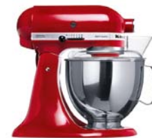
EMPIRE RED 5KSM150PSER

Saint Valentine's Day is the annual commemoration held on February 14th celebrating love and affection between intimate companions. Colours belonging to this precious palette range from the glossy Candy Apple to the passionate Empire Red, and Raspberry Ice as well as charming Chrome.