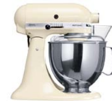
ALMOND CREAM 5KSM150PSAC