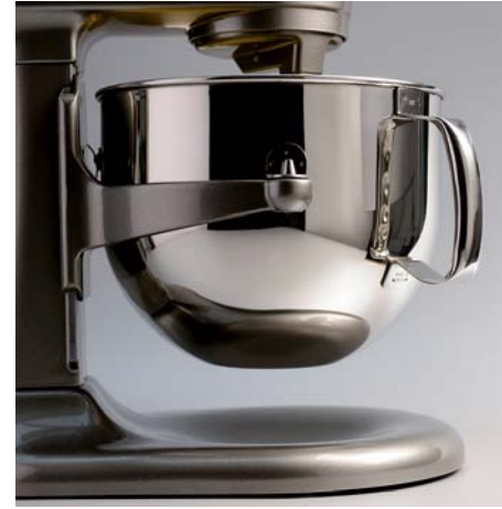
6.9 L BOWL 5KR7SB AND POURING SHIELD 5K7PS

Highly polished stainless steel Bowl with comfortable handle and a 1-piece, dual purpose accessory that helps prevent splashing. The pouring spout allows you to add ingredients smoothly whilst mixing. Made out of transparent Lexan, it affords a full view of the ingredients in the bowl. The 6.9 L Bowl can easily handle 3.6 kg mashed potatoes, 8 bread loaves of 450 g and even 16 pizzas.