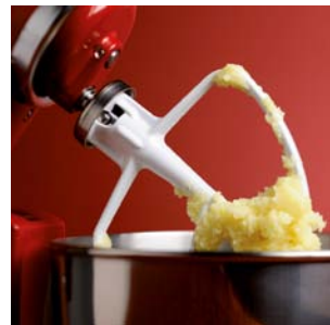
FLAT BEATER K5THCB

Used for mixing and kneading yeast dough such as bread, pizza dough and pasta dough. Made out of aluminium and anti-stick nylon coated. Dishwasher-safe.