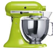
GREEN APPLE 5KSM150PSGA