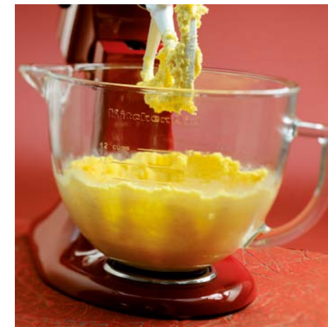
4.8 L GLASS BOWL 5K5GB**

Polished stainless steel bowl with ergonomic handle and a 1-piece, dual purpose accessory that helps prevent splashing. The pouring spout allows you to add ingredients evenly whilst mixing. Made out of transparent Lexan, it affords a full view of the ingredients in the bowl.