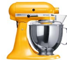
YELLOW PEPPER 5KSM150PSYP