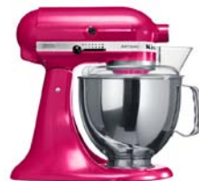
RASPBERRY ICE 5KSM150PSRI