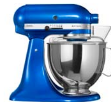
ELECTRIC BLUE 5KSM150PSEB