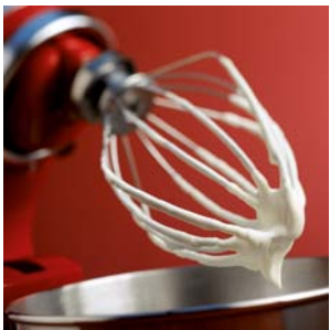
WIRE WHISK K45WW

Used for incorporating air into eggs, egg whites, whipping cream and dips (such as mayonnaise). Made from hand polished aluminium with metal head. Not dishwasher-safe!