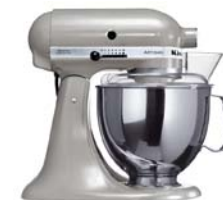
METALLIC CHROME 5KSM150PSMC