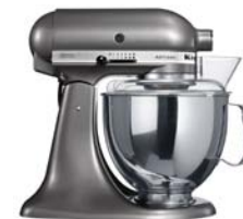
MEDALLION SILVER 5KSM150PSMS