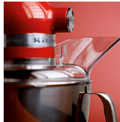
4.8 L BOWL 5K5THSBP* AND POURING SHIELD 5KN1PS*

Used for heavy mixtures such as cakes, frostings, cookies and mashed potatoes. Aluminium made and anti-stick nylon coated. Dishwasher-safe.