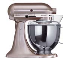
BRUSHED NICKEL 5KSM150PSNK

Celebrating men in the kitchen, the KitchenAid™ brand devotes a special palette just to father's day. The colours selected for this palette are sophisticated yet masculine: Espresso, Brushed Nickel and Electric Blue.