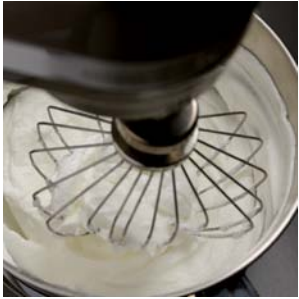
ELLIPTICAL 11-WIRE WHISK 5K7EW

Stainless steel 11-Wire Whisk has an elliptical shaped design to maximize bowl coverage allowing large capacity whipping just as quick and easy as smaller volumes. It has just the right shape and size to optimize the best whipping results.