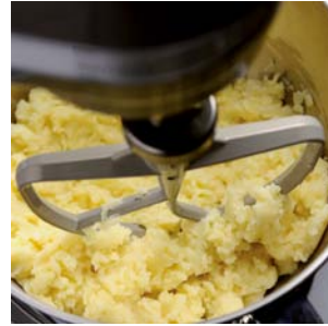
FLAT BEATER 5K7SFB

Stainless steel PowerKnead Dough Hook and stainless steel Flat Beater provide optimal coverage of the large 6.9 L bowl. Handles both small and large jobs.