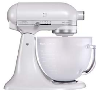
FROSTED PEARL 5KSM156FP