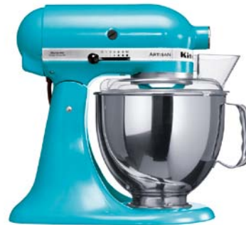
CRYSTAL BLUE 5KSM150PSCL

Crystal Blue is an exotic colour that sparkles when used as an accent. The tone is so compelling that it is able to fill any kind of surface or shape, making it immediately absorbing and eye catching.