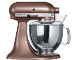
APPLE CIDER 5KSM150PSAP

The Christmas holidays are the perfect time to give a KitchenAid™ Stand Mixer. The stand mixer is in particular demand during holidays when preparing holiday meals for the whole family really get under way. The Christmas period often makes us think about family warmth, good filling food and sweets. For this festive season the predominant colours in this palette are White plus the creamy shades of Almond Cream, Café Latte and Apple Cider bronze.