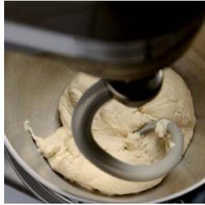
POWERKNEAD SPIRAL DOUGH HOOK 5K7SDH

Stainless steel 11-Wire Whisk has an elliptical shaped design to maximize bowl coverage allowing large capacity whipping just as quick and easy as smaller volumes. It has just the right shape and size to optimize the best whipping results.