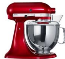
CANDY APPLE 5KSM150PSCA