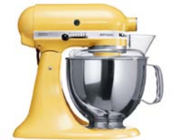
MAJESTIC YELLOW 5KSM150PSMY

Coloured eggs are mainly related to Easter time, when the KitchenAid™ Stand Mixer comes into its own when employed in preparing various cakes and chocolate recipes. For this holiday season, we find another great occasion that takes into account the Artisan™ Stand Mixer as a present. These spring colours consist of Green Apple, Pink, Ice Blue and Majestic Yellow.