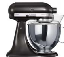
BLACK STORM 5KSM150PSBZ

Halloween is becoming a worldwide annual holiday observed on October 31st, which traditionally means trick-or-treating from door to door and so creating those holiday treats with the KitchenAid™ Stand Mixer. The Halloween palette includes two appropriate tones of black, Onyx Black and Black Storm, the Metallic Chrome and the inevitable Tangerine (orange).