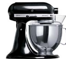
ONYX BLACK 5KSM150PSOB